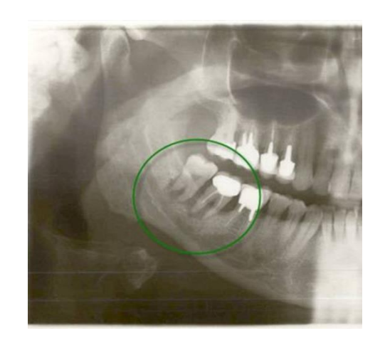
Prior to treatment

Results: Very strong bone-dentin was formed. Two month after grafting the site was solid. Implants were inserted and prosthetic work performed. A two year follow up shows that autologous tooth graft is best for long lasting implant stability.