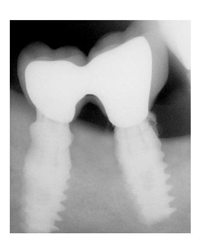
Follow up 2 years after grafting